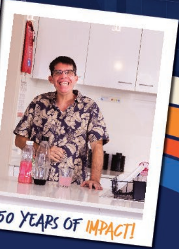
50 YEARS OF IMPACT!