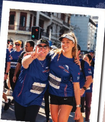
50 YEARS OF COMMUNITY!