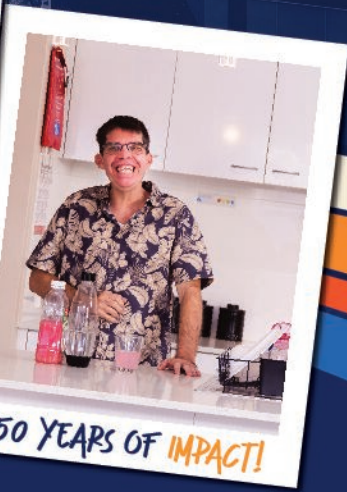
50 YEARS OF IMPACT!