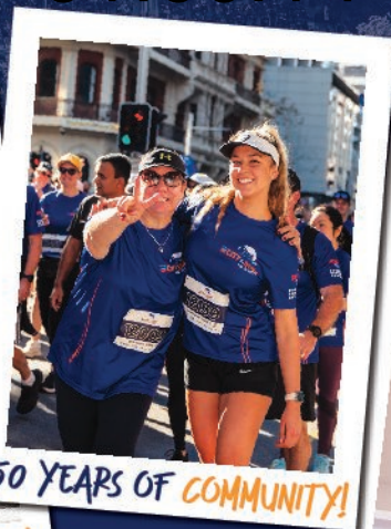
50 YEARS OF COMMUNITY!